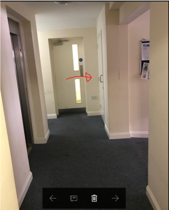
This is the meter (circled below).