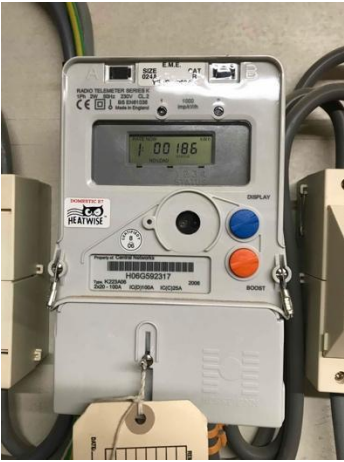
Serial Number is H06G592317

You will need to decide on a provider for your electricity and call them to activate an account. You will need to give them the reading sent to you by the property manager when you moved in.